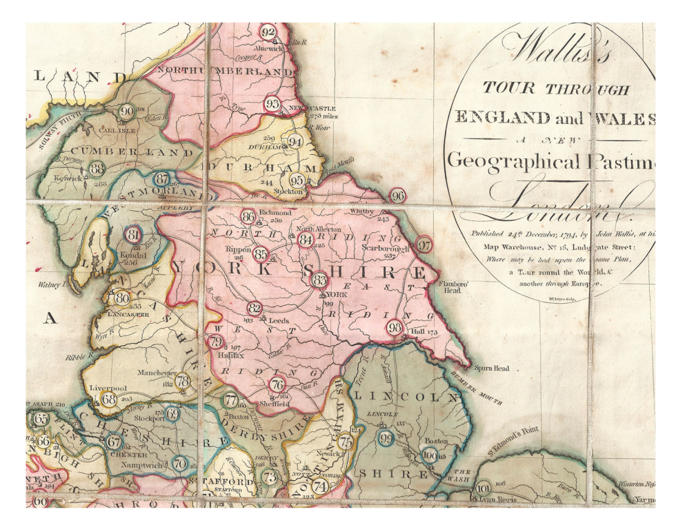
Figure 1 Part of Wallis's Tour through England and Wales, a New Geographical Pastime.

Upon landing on a place, players were often required to miss a turn(s) to view, for example, a cathedral, or a manufacturing process, sometimes also paying counters into a kitty for the privilege of so doing. Players occasionally were sent backwards; often because they had landed on a place associated with a vice, for example, Newmarket and gambling on horse races.<sup>30</sup>